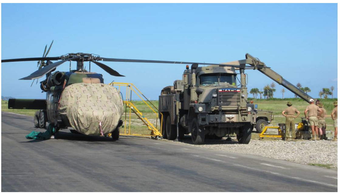
RAEME (Aviation & Ground) working in harmony.

One of our more challenging moments was an engine change to A25-107 two days prior to its Return to Australia for an R2. A big thanks to our fellow Ground RAEME brethren for the lifting support.