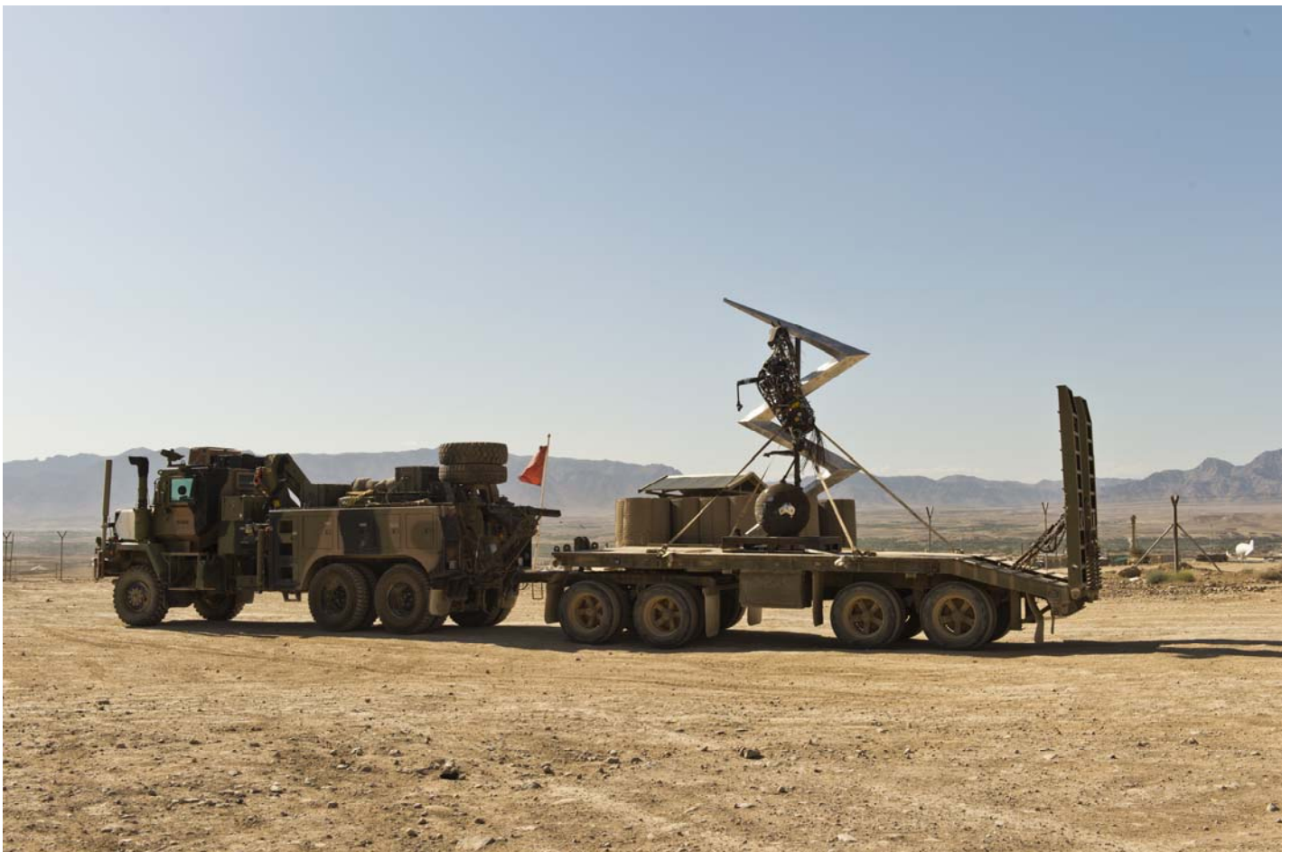
“Harry the Horse” prepared for Return To Australia. The sculpture is currently housed at the Army Museum – Bandiana.