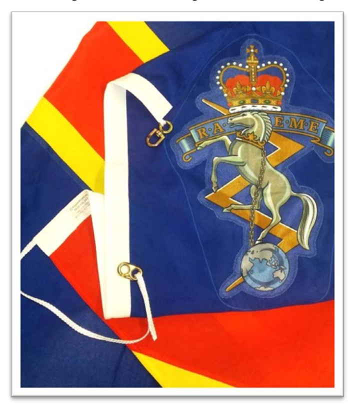
The RAEME Corps Flag: $395 Dimensions: 1800×900 mm Manufacturer: Carroll & Richardson

Email the <u>Head of Corps Cell</u> to purchase. Postage to a military workplace is free of charge. Postage to a civilian address will incur an extra charge — approximately $14.00.