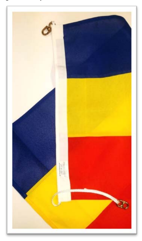
The Flag, Identification, Workshop: $125 Dimensions: 900×600 mm Manufacturer: Carroll & Richardson

The Head of Corps Cell has RAEME Flags and the Flag, Identification, Workshop (Tricolour) for sale. The flags are designed and constructed in accordance with the Army Ceremonial and Protocol Manual and RAEME Corps Instructions. The flags are fully sewn and feature metal fitments. The RAEME Flag is constructed using the new RAEME logo.