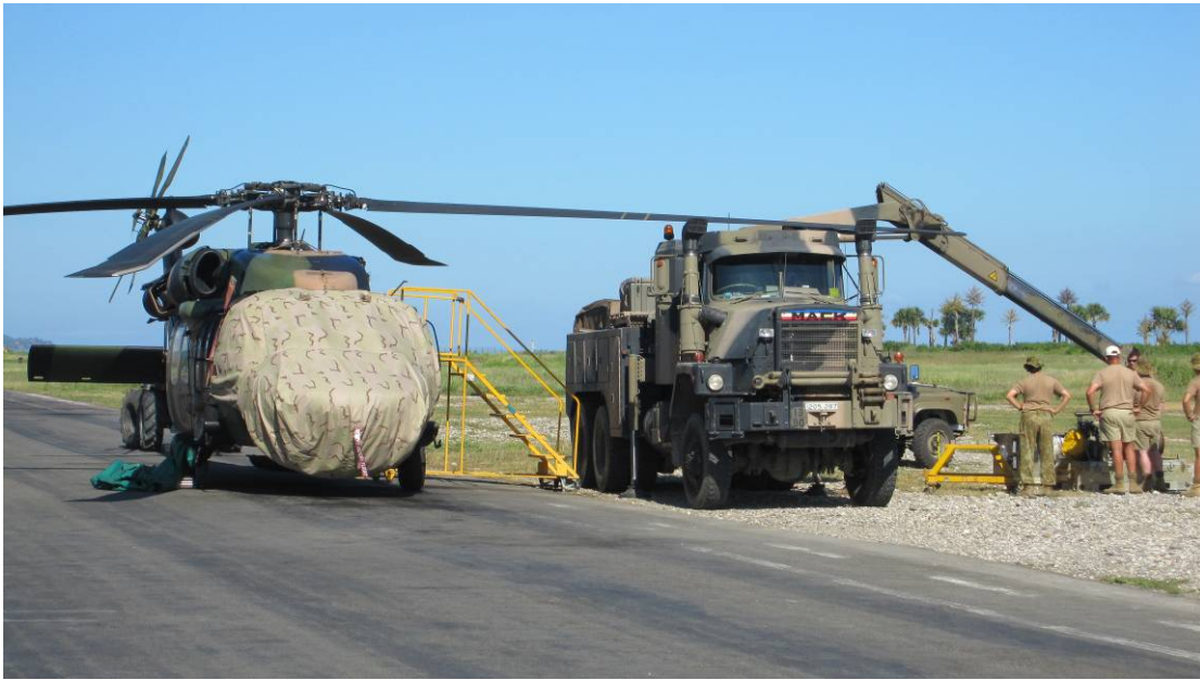
RAEME (Aviation & Ground) working in harmony.

One of our more challenging moments was an engine change to A25-107 two days prior to its Return to Australia for an R2. A big thanks to our fellow Ground RAEME brethren for the lifting support.