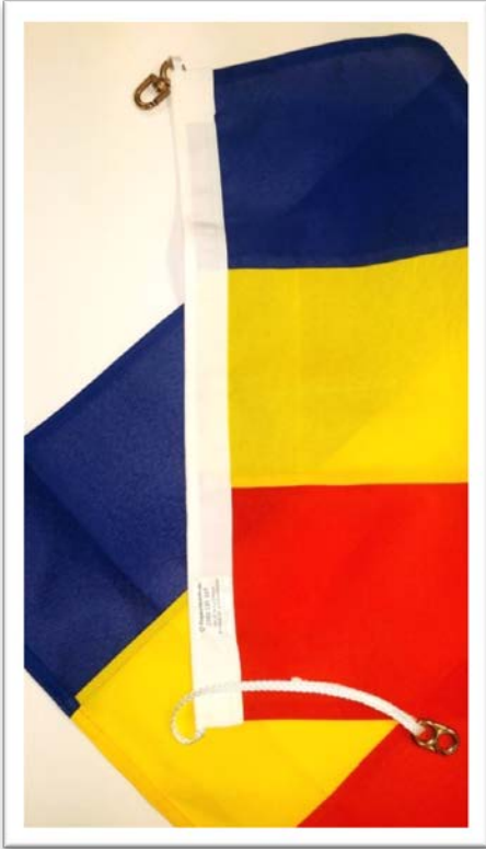
The Flag, Identification, Workshop: $125 Dimensions: 900×600 mm Manufacturer: Carroll & Richardson

The Head of Corps Cell has RAEME Flags and the Flag, Identification, Workshop (Tricolour) for sale. The flags are designed and constructed in accordance with the Army Ceremonial and Protocol Manual and RAEME Corps Instructions. The flags are fully sewn and feature metal fitments. The RAEME Flag is constructed using the new RAEME logo.