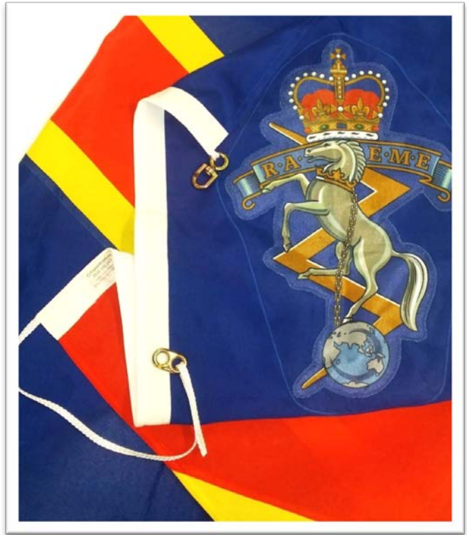
The RAEME Corps Flag: $395 Dimensions: 1800×900 mm Manufacturer: Carroll & Richardson

Email the Head of Corps Cell to purchase. Postage to a military workplace is free of charge. Postage to a civilian address will incur an extra charge — approximately $14.00.