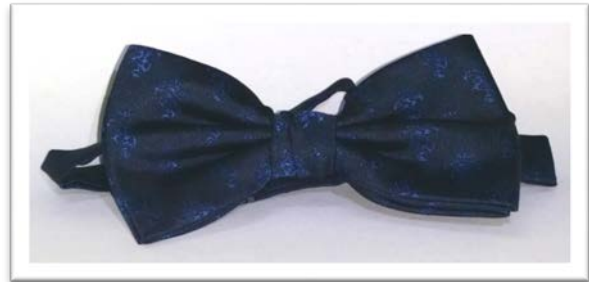
RAEME Bow Tie: $30 RAEME bow tie in dark blue with embroidered Corps Logos in Union Jack Blue. In polyester with pre-tied knot and metal clasp attachment.

Email the Head of Corps Cell to purchase. Postage to a military workplace is free of charge. Postage to a civilian address will incur an extra charge — approximately $14.00.