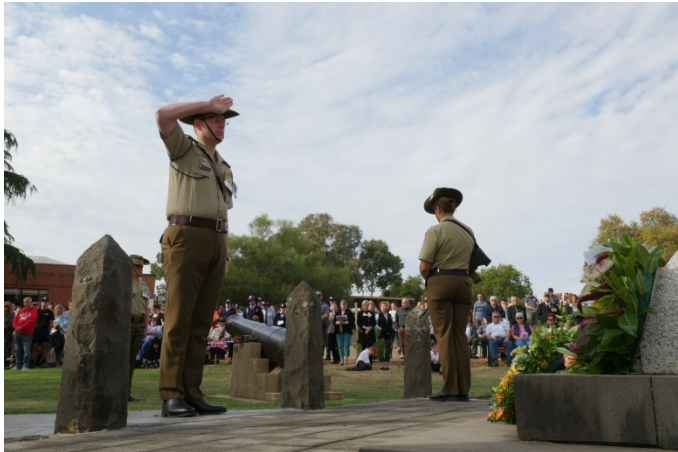
ANZAC Day

ANZAC Day at Rutherglen. ASEME paraded the RAEME Banner at Rutherglen, with LTCOL Bouloukos, CSM addressing the gathering and laying a wreath.