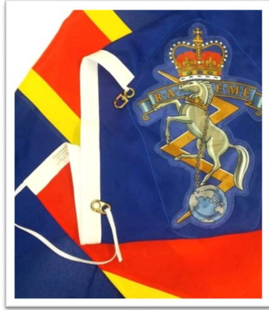
The RAEME Corps Flag: $395 Dimensions: 1800×900 mm Manufacturer: Carroll & Richardson