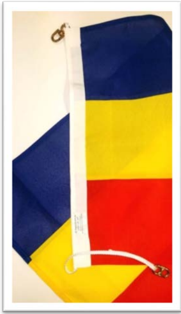
The Flag, Identification, Workshop: $125 Dimensions: 900×600 mm Manufacturer: Carroll & Richardson

The RAEME Flag and the Flag, Identification, Workshop (Tricolour) for sale are designed and constructed in accordance with the Army Ceremonial and Protocol Manual and RAEME Corps Instructions. The flags are fully sewn and feature metal fittings. The RAEME Flag is constructed using the new RAEME logo.