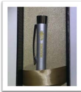
Stainless Steel Parker Pen: $30 Ballpoint pen, engraved with “RAEME” and the Corps Logo